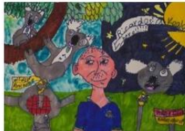
'Save Campbelltown Wildlife' Leela Stuccebauer